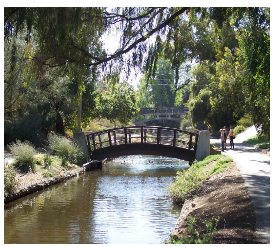
The UC Davis Arboretum

The city of Davis has been called the most "energy-conscious" city in the United States. It is an interesting, forward-looking city of about 65,600 located in California's Central Valley. It lies 15 miles west of Sacramento, the State capital, and 75 miles northeast of San Francisco. Davis residents can take advantage of the recreational opportunities of Lake Tahoe, Northern Sierra Nevada, Napa Valley, and the beaches of northern California.