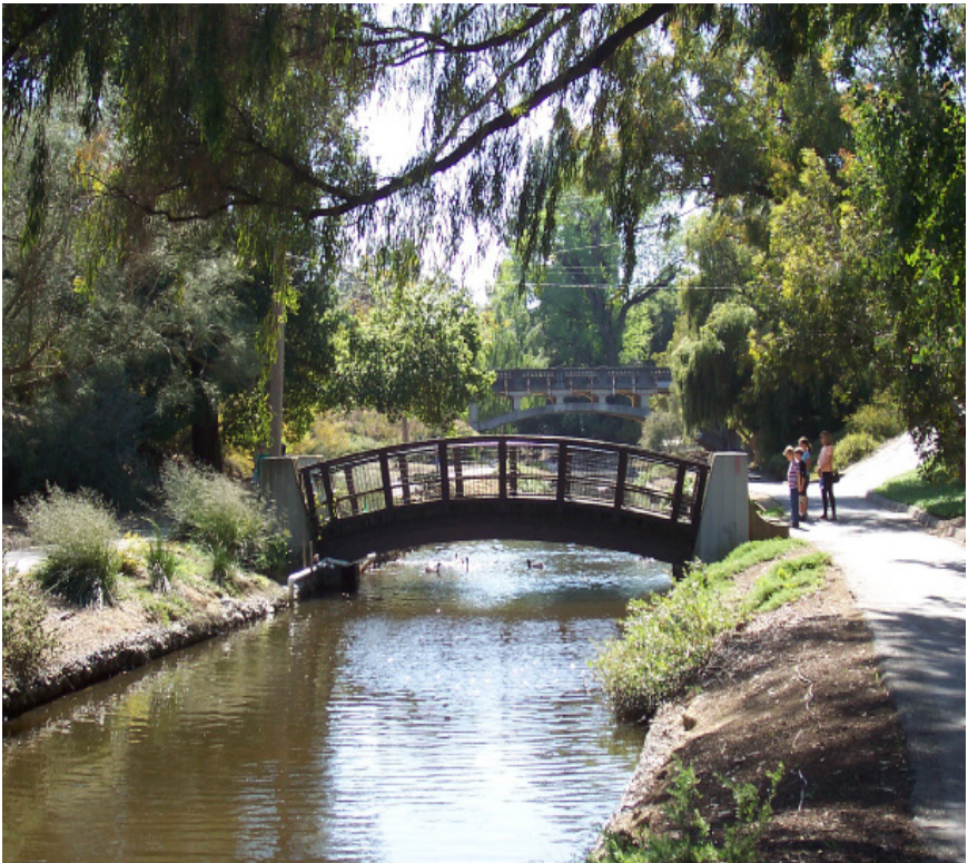
The UC Davis Arboretum

The city of Davis has been called the most “energy-conscious” city in the United States. It is an interesting, forward-looking city of about 65,600 located in California’s Central Valley. It lies 15 miles west of Sacramento, the State capital, and 75 miles northeast of San Francisco. Davis residents can take advantage of the recreational opportunities of Lake Tahoe, Northern Sierra Nevada, Napa Valley, and the beaches of northern California.